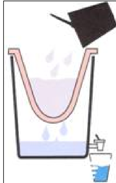
Cross Section of Ceramic Pot Filter

The filter pot should be regularly cleaned using a cloth or soft brush to remove any accumulated material. It is recommended that the filter pot be replaced every 1-2 years. This is in part to protect against fine invisible cracks which may have developed over time. Any cracks will reduce the effectiveness since water can short-circuit without being filtered through the ceramic pores.