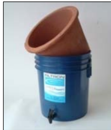
Flat Bottom Ceramic Pot Filter