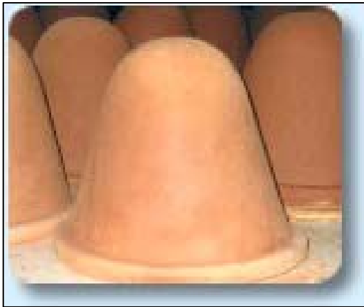
Round Bottom Ceramic Pot Filter