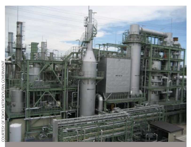
The sewage sludge gasification furnace plant at the Kiyose Water Reclamation Center, Tokyo.

The fact that greenhouse gases are emitted in large quantities from sewage treatment facilities is because sewage sludge from wastewater