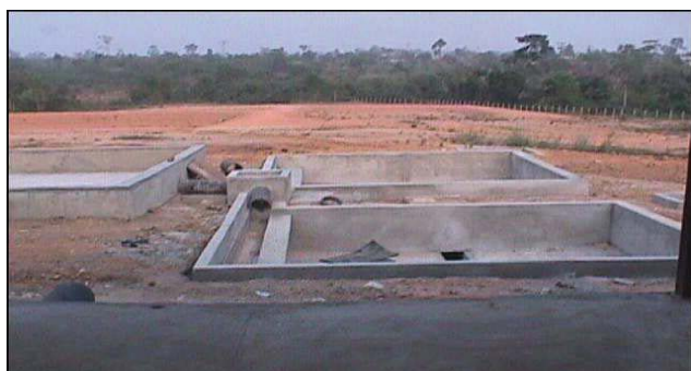
Fig. 4: Faecal sludge drying beds.

FS (excreta mixed with water) is collected from unsewered public toilets (type of toilet is described in Section 3) and household septic tanks by vacuum trucks within the city of Kumasi and transported to the project site for drying on sludge drying beds. Due to its too high moisture, fresh FS is unsuitable for direct aerobic composting. Hence a solid-liquid separation is needed to produce sludge of adequate water content for co-composting. For solid-liquid separation, sludge drying beds including a sand-gravel filter medium for drainage were built. They are loaded with the faecal sludge (a mixture of public toilets sludge and septic tanks FS in the ratio of 1:2). The drying process is enhanced by evaporation and gravity percolation.