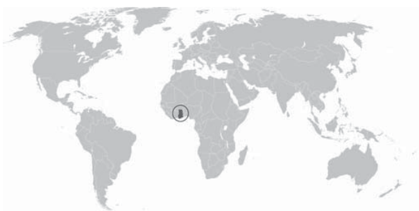
Fig. 1: Project location