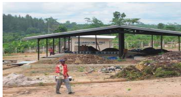
Fig. 3: Co-composting facility (open window system) in Kumasi (source: IWMI, 2003).

Kumasi is the second largest city in Ghana, West Africa. The city has 1 million inhabitants (growth rate of 3% per year).