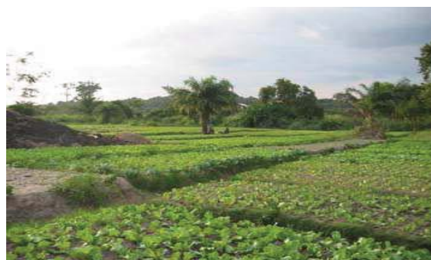
Fig. 6: Lettuce farm fertilised with compost at Gyenyasi farmers Association in Kumasi (source: Nikita Eriksen-Hamel, 2002).

The farmers who were skeptical (17%) feared that the excreta component could still spread infections and thought that consumers might avoid crops being fertilised with excreta-based compost (there is however no evidence that consumers would avoid crops that were fertilised with excreta-based compost).