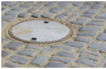
Above both: Covers are available for pedestrian (centre: G-type collection chamber) or heavy duty loading (right: Z-type collection chamber).