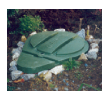
Left and centre: G- and Z-type collection chamber – The vacuum valves are installed in the valve chamber of the Roevac® collection chamber, hygienically separated from the wastewater in the sump.