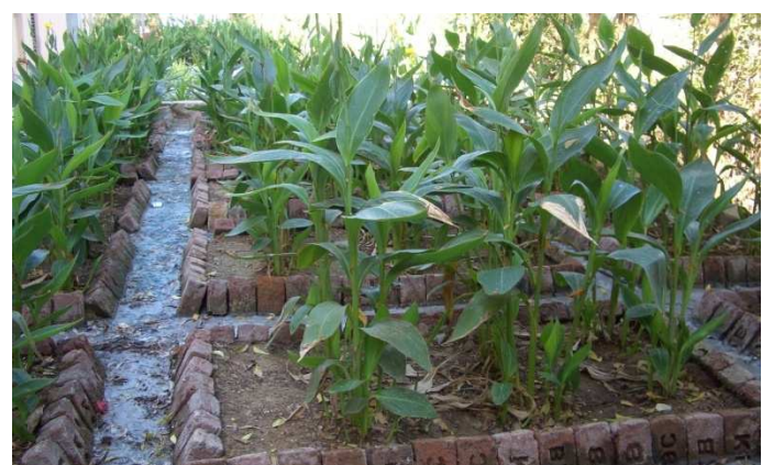
Fig. 14: Elevated gardens for the infiltration of greywater

Greywater collected from the showers and laundry area at the hostel is discharged to elevated greywater gardens (Fig. 15) for infiltration. They are elevated to prevent flooding by surface water during monsoon season. Any surplus of water that does not infiltrate into the soil is collected in a tank and is reused for irrigation purposes during dry periods.