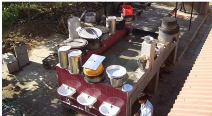
Fig. 11: View of new stand for washing utensils at outdoor kitchen area

In addition to the dishwashing stall a stall for washing kitchen utensils (Fig. 11) was built. The effluent from this stall was (after being treated in a vertical flow organic filter to retain solid matter) was directly applied in irrigation of nearby bushes and trees.. However, after a few months a short sewer was laid and the water is drained to the tank that also receives the effluent from the dishwashing stall. Biowaste from the kitchen utensils is cleaned with ash before washing them and the spent ash is cocomposted (Fig.11). The water is then supplied for irrigation by a solar panel operated pump