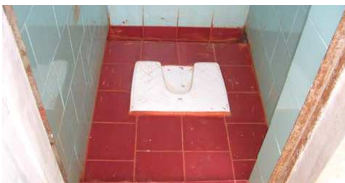
Fig. 7: View of ladies squatting urinals (source: seecon gmbh, August 2006) supplier Shital

There are separate urinals for women (Fig. 7). The urine is drained through the drain channel at the edge of the room and collected in the tanks.