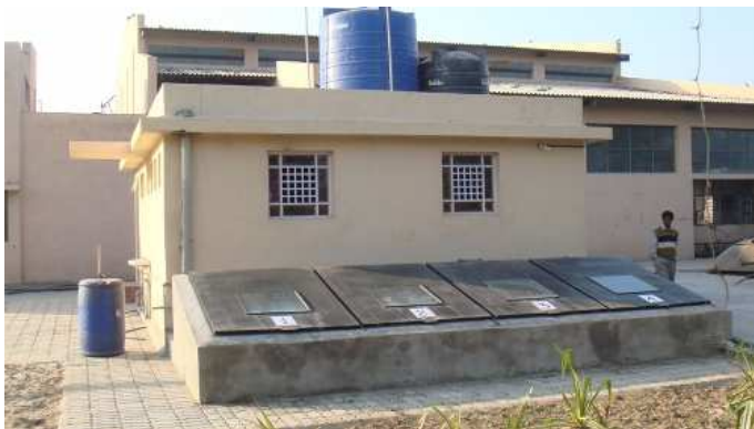
Fig. 6: View of urinal centre, the 4 urine collection tanks (in the foreground) and the storage/hygenisation tanks (atop roof).

The urinals are waterless urinals and require to be flushed 2-3 times in a day only.