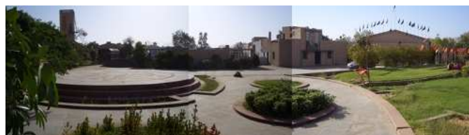
Fig. 3: Navsarjan Vocational Training Institute "Dalit Shakti Kendra" (DSK) in Nani Devti village.

The vocational training institute "Dalit Shakti Kendra" (DSK) was built on an area of 32,000 sq. meters in Nani Devti village near Sanand, about 30 km southwest of Ahmedabad City in the state of Gujarat, west of India in 1999. The institute buildings constitutes of administration, kitchen, a workshop, a hostel and a Community Training Centre. The institute is used by a variable number of students (up to approx. 240) and approx. 20 staff members (some of them living on the campus). Thus the number of people staying on the campus is approx. 260. At times, this number can significantly increase when people attending meetings and/or workshops at DSK are staying overnight.