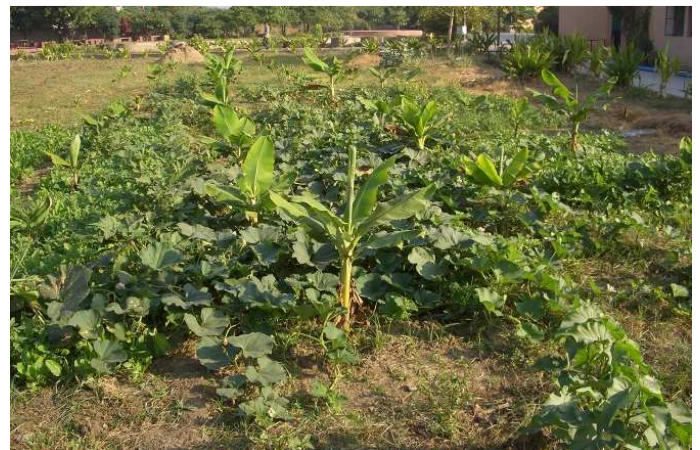
Fig. 16: One out of many small gardens used for growing vegetables (e.g. spinach, brinjals, etc.) and fruits at DSK campus (e.g. bananas).