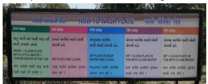
Fig. 9: Newly designed instruction board on "How To Wash Plates" (fixed above the dishwashing stall).

This has proved to be better as biowaste does not clog the filters.