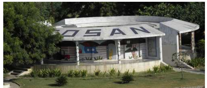
Fig. 4: New sanitation complex with 22 pour-flush toilets and biogas plant built in 2006 (source: seecon gmbh, October 2009).

A new and conveniently located (75m from Community Training Centre and less than 75m from the Hostel) common sanitation complex was built for the approx. 250 people staying on the campus on an average. The sanitation complex consists of 22 toilet cabins (11 for females and 11 for males) arranged in a circular shape around a biogas plant located in the center (Fig. 4).