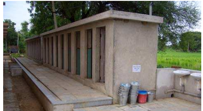
Fig. 12: View of showers installed at the hostel building, the footpath in front of the showers is used for washing clothes (source: seecon gmbh, August 2006).

2 new shower blocks comprising shower facilities (total number: 40), washbasins and laundry facilities (Fig. 13) have been constructed behind the hostel building (Fig. 12) and next to the Community Training Centre to serve people staying at the campus.