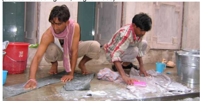
Fig. 13: Students washing clothes in front of the showers (source: Navsarjan, August 2006).

Greywater collected from the showers and laundry area at the hostel is discharged to elevated greywater gardens (Fig. 15) for infiltration. They are elevated to prevent flooding by surface water during monsoon season. Any surplus of water that does not infiltrate into the soil is collected in a tank and is reused for irrigation purposes during dry periods.