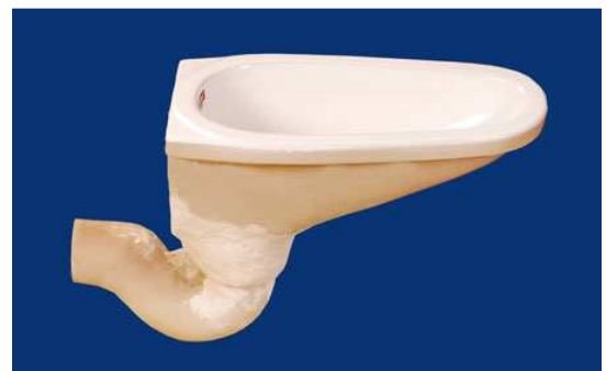
Fig. 5: Pour-flush squatting pan ("rural pan") and water seal ("P-trap") (supplier: Shital Ceramics, India).

In these toilet cabins, pour-flush squatting pans (so-called "rural" or "pour-flush" pans) made of ceramics were installed which are equipped with a water seal (Fig. 5) and are supplied by the Indian company Shital Ceramics.