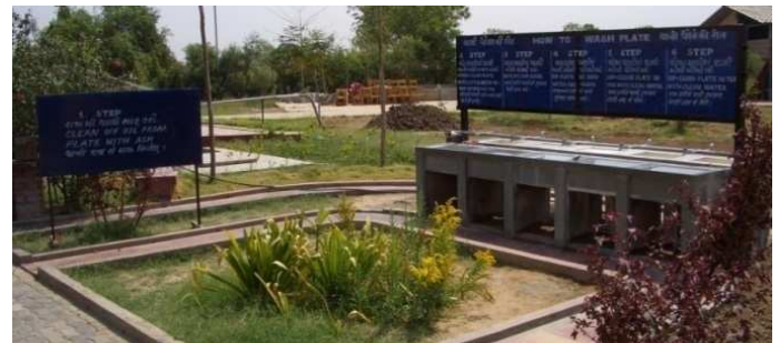
Fig. 8: View of new stand for washing dishes.

A new stall for dishwashing (Fig. 8) was built. It was planned to lead the dishwashing stall effluent via a vertical flow organic filter (filter material: rice husk) to a storage tank.