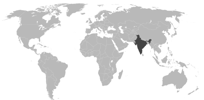
Fig. 1: Project location