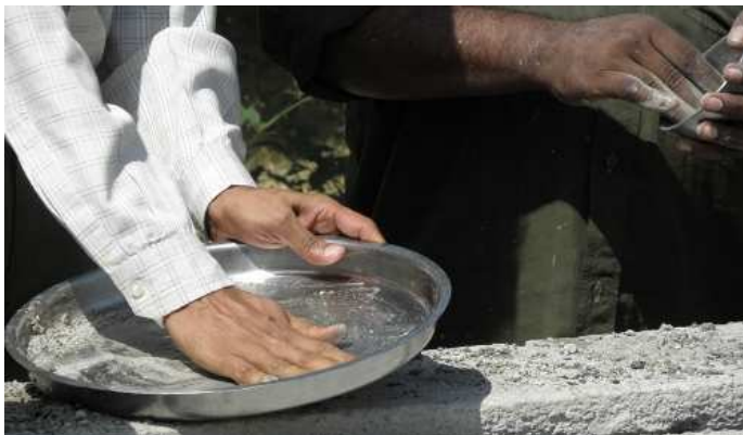
Fig. 10: 1 st step of cleaning plates: removing grease/oil by wiping out plates/utensils with wood ash.