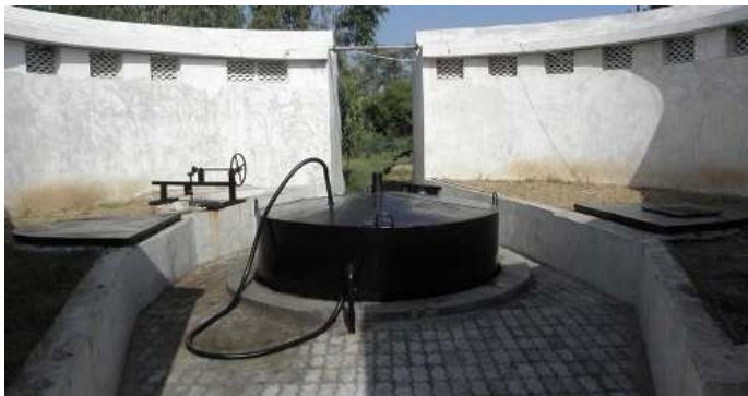
Fig. 15: View of floating drum-type biogas plant (with water jacket) for treatment of blackwater.

Because of the high groundwater table during monsoon season the local engineer proposed construction of the biogas plant to be done in reinforced cement concrete instead of brickwork. To prevent buoyancy of the biogas plant, the thickness of the base has been increased to 45 cm and the base protrudes the outer diameter of the cylindrically shaped digester body by 50 cm. At an inner diameter of 2.75 m and a clear height of 4.55 meters (approx. 25 cm less than shown in the technical drawings) the net digester volume is approx. 27 m 3 .