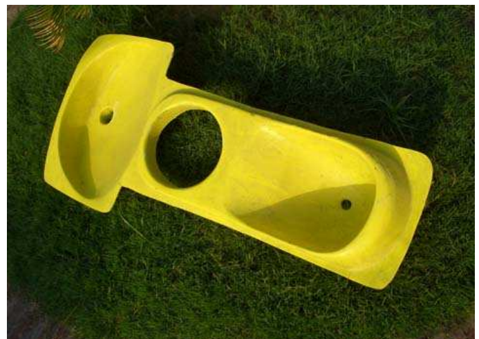
Fig. 17: Urine-diversion squatting pan that allows separate collection of urine, faeces and anal washwater (source: seecon gmbh, 2006)supplier – Aries.

The overall design of the UDDTs (implemented as Single Chamber Urine-Diversion Dehydration Toilets) and the shallow cleansing water collection bowl (see Fig. 18), which resulted in spilling of the anal washwater into the faeces hole (the anal washwater section on the left of the pan was found to be too small). Also as the anal washing was located just behind the faeces hole, it was visually discomforting for the users during anal cleansing. This reasons led to closing-down of the toilets. It is therefore preferable to separate the anal cleansing from the pan.