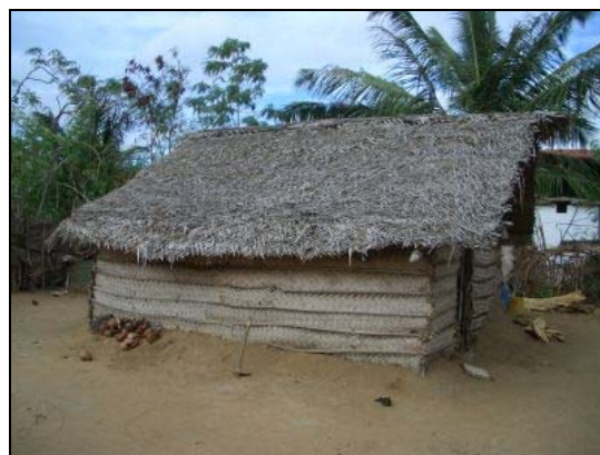
House of respondents