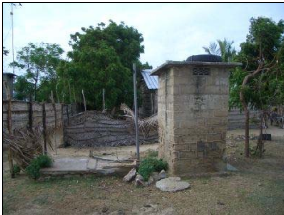
Toilet in Saltern with corroded bricks

The majority of the families live on food stamps from the government. According to the community leader about 30 families have an extra income from labor on private land.