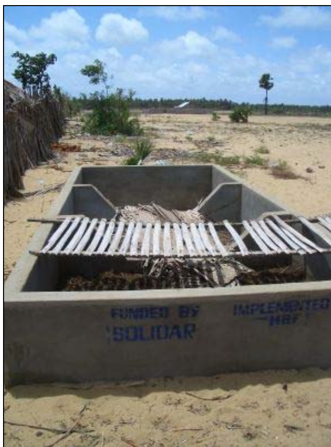
Compost Station at 90 Acres

Care International started a composting project in July 2006. One compost tank will be built per 10 houses.