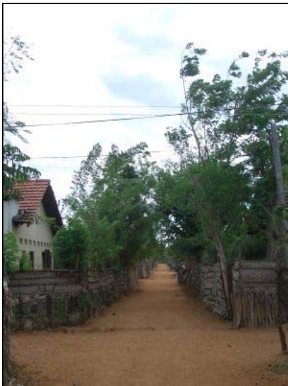
Relocation Site Hijarath Puram

The people living in Hujarath Puram now mostly own the land and want to stay. According to the respondents of the interview nearly all of them have toilets. The few which do not have any sanitation facilities would dump the excreta inside their compound.