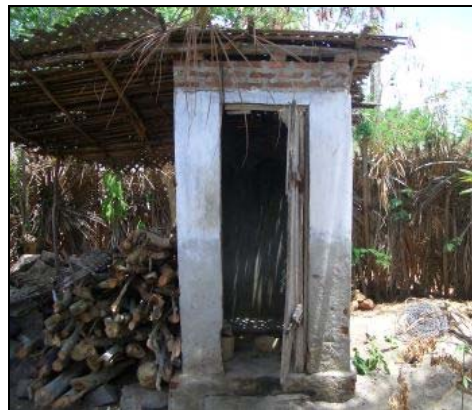
Toilet of Respondent