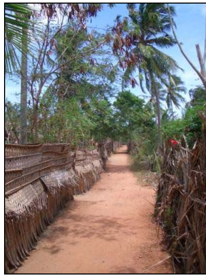
Relocation Site Karambe

According to RDF employees the majority of the residents of Karambe have pit latrines.