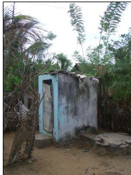
Toilet of respondents