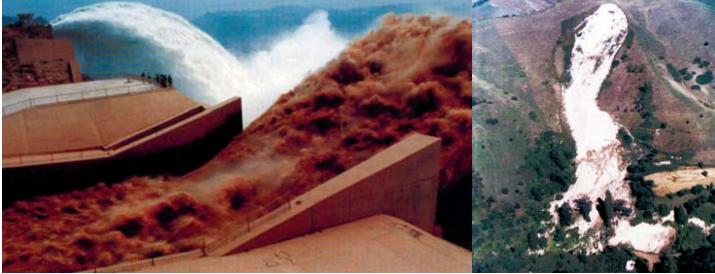
Left photo: Sediment flushing at Xiaolangdi, project, Yellow River. Right photo: Landslide.

from a reservoir can cause downstream river bed degradation. If no action is taken to remediate the sedimentation problems, a reservoir may lose its original design functions, and may pose a safety concern.