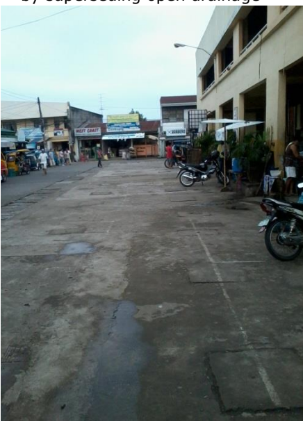
The units of the DEWATS plant are installed underground. Therefore, the system is nearly invisible. Bauang Public Market

Reducing environmental pollution by superseding open drainage