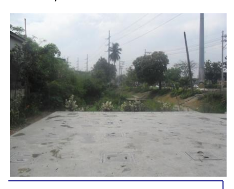
The surface of the decentralized underground DEWATS system can be used as parking space. Pabahay sa Riles Paco, Manila

DEWATS for Residential Areas is an affordable solution to fill gaps in urban wastewater treatment services for individual houses, residential enclaves and apartment blocks from every income-level. With regard to legal regulations and space constraints, an on-site underground wastewater treatment (DEWATS) provides state-of-the-arttechnology when constructed and installed. The design and the capacity of the system are adaptable according to demand. A DEWATS can be applied to new constructions and existing Residential Areas structures. The interests of all stakeholders are reconciled throughout the whole implementation process. Routine operation and maintenance, to ensure the sustainability of the plant, can be done by trained local staff.