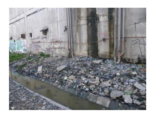
Discharge of untreated wastewater into the canal: a consequence of missing connections to a central sewerage system.

As a result, most urban Residential Areas with on-site facilities has only a small septic tank for each household. In the majority of cases, this solution does not meet governmental guidelines on wastewater effluent.