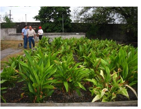
The DEWATS horizontal gravel filter can be aesthetically incorporated in the local surroundings. Dumaguete Public Market