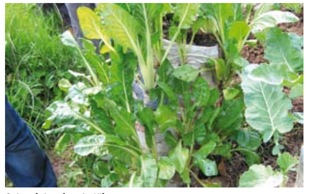
Spinach in a bag in Kibera

around 33 USD per month, which is more than the average monthly income per family (June 2008)<sup>4</sup>.