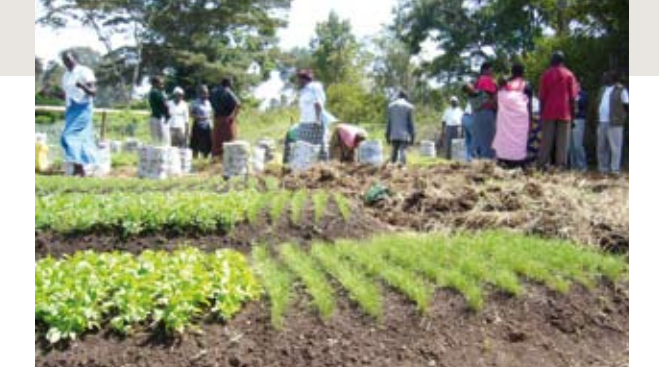
Ongoing training in seed bed

Two models of vegetable sacks have been tried out: one with a stone spine and one with layers of stones. The latter appeared to be less interesting since the planting area is smaller than in model 1, which offers planting area for seedlings all around the bags.