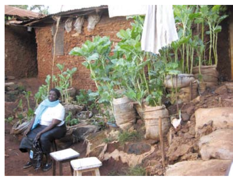
Woman cultivating kale in Kibera

During the first phase of the programme in Kibera, over 11,000 beneficiary households adopted the technique and